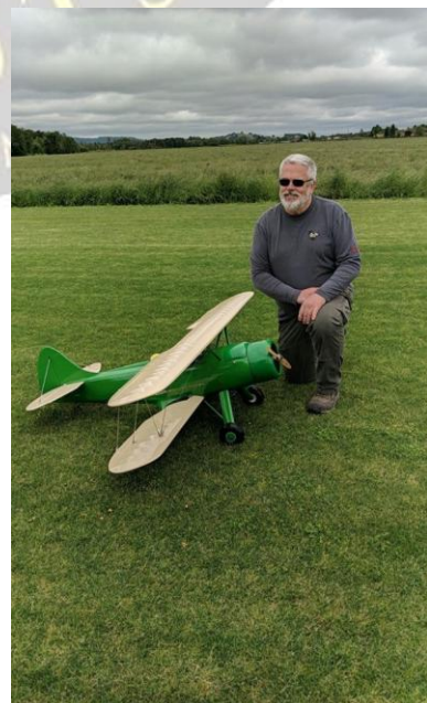
Winter build 2019 planes