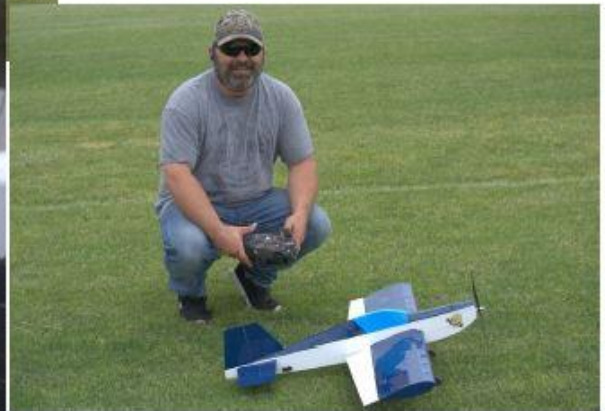
Winter build 2018 planes